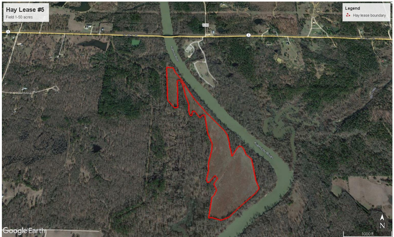
Lease #5 Field 2 Boundary