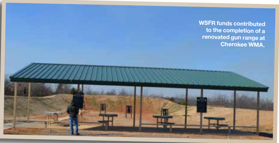
WSFR funds contributed to the completion of a renovated gun range at Cherokee WMA.