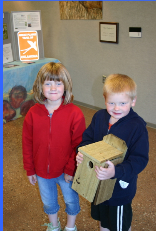
These were taken during Hackberry Flat Day in southwest OK. Friends of Hackberry Flat and FFA students from Frederick High School helped visitors construct Bluebird nest boxes. May 9, 2009