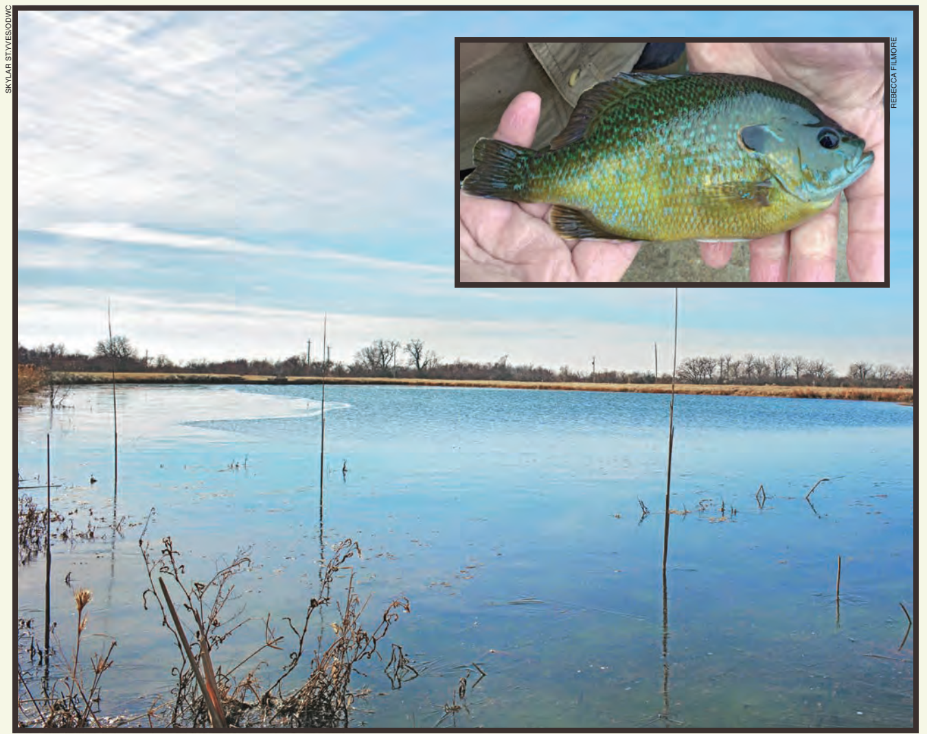
This is the half-acre pond used for the brood stock of male bluegills and female green sunfish at the Byron Hatchery. The hatchery's hybrid sunfish (inset photo) are produce by 10 to 20 pairs naturally each year.

Most Oklahomans' introduction to fishing came by catching sunfish in a farm pond and the Close to Home fishing program aims to continue that legacy by providing a feisty fish for families to catch in their neighborhood waters.