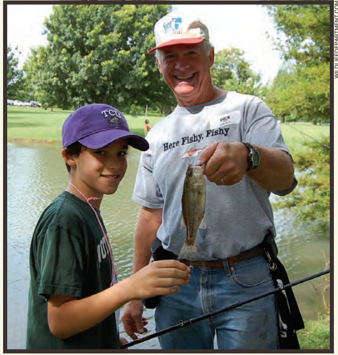
Aquatic Education Resource Program volunteers from across the state help young anglers catch their first fish at CTHP fishing areas.