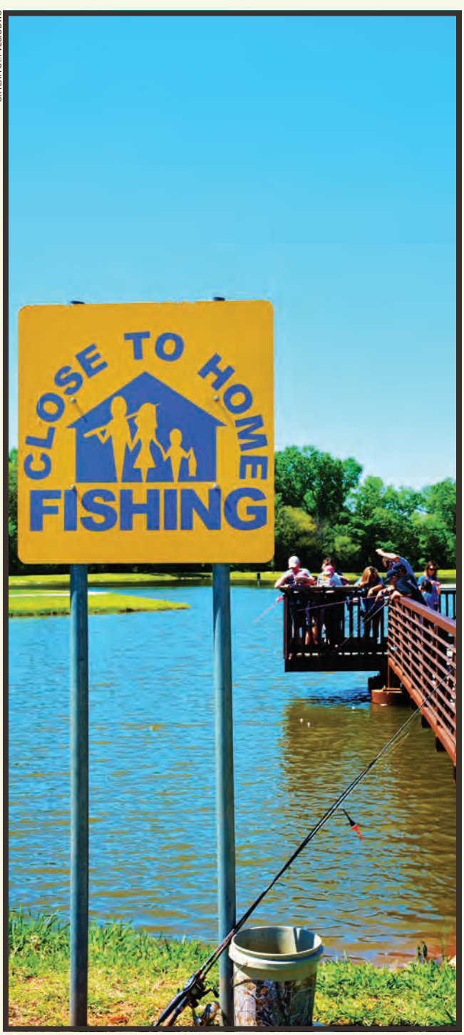
Edwards Park in Oklahoma City provides excellent bank and fishing pier access for anglers. The 5-acre lake is a great place to catch catfish and sunfish.

Fisheries management activities for all CTHP waters involve creating put-growtake fisheries by stocking low to moderate numbers of juvenile fish that will grow to a more desirable size that will please anglers. This approach has been moderately successful at ponds with low angling pressure. Ponds with fish feeders tend to show better growth.