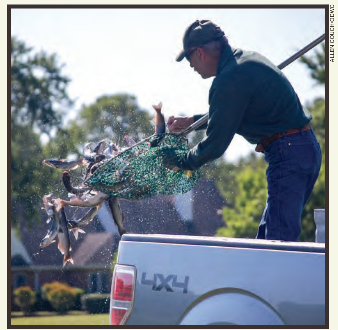
Channel catfish like these are stocked statewide in CTHP waters.

In the next several pages, we'll highlight some of our favorite areas from each region along with the CTHP fishing regulations, a story about hybrid sunfish production at our Byron fish hatchery as well as fish identification of common sport fish found in Oklahoma. Happy fishing and tight lines!