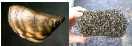
single zebra mussel and zebra mussel encrusted rock from Oologah Reservoir

These threats to Oklahoma's natural systems are both real and immediate. Zebra mussels currently inhabit several systems in northeast Oklahoma and new infestations are being found annually. Zebra mussels have the potential to reduce the productivity of infested systems, cause economic loss by clogging pipelines, locks and dams, marinas, and outboard motors, and impact recreational opportunities by fouling beaches (swimmers now have to wear tennis shoes at Oologah or risk being cut by mussel shells).