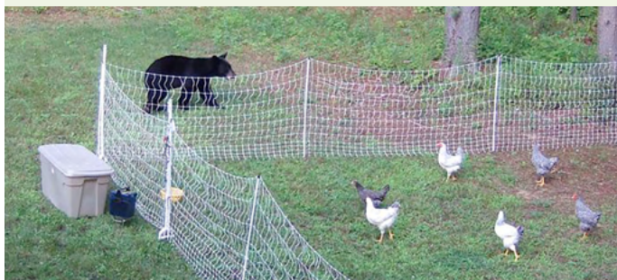
A portable solar electric netting fence can protect foraging chickens from bears during the day, but is not a permanent solution.

BearWise.org/keep-bears-out/electric-fencing/