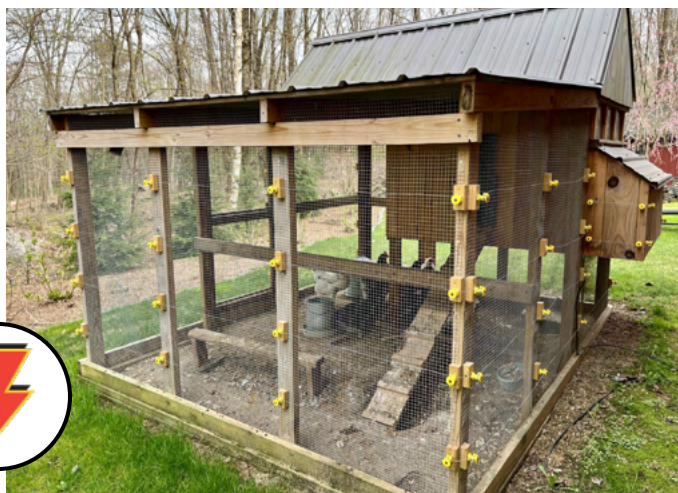
The cost of electric fencing materials adds up to far less than the cost of replacing your flock and coop.