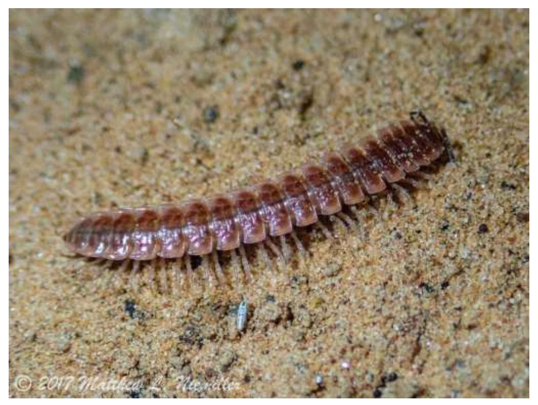
Figure 5. A polydesmid millipede observed in Duncan Field Cave, Adair Co., Oklahoma on 15 December 2017.