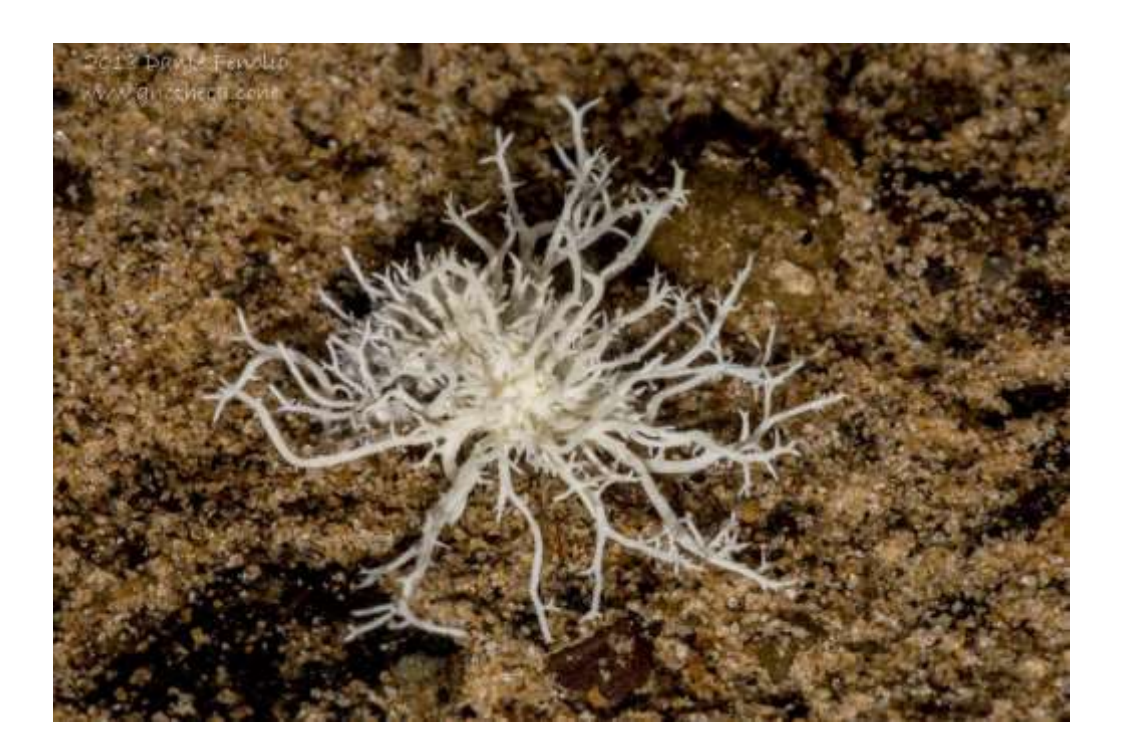
Figure 6. Fungus growing from bat guano; observed in Duncan Field Cave, Adair Co., Oklahoma on 15 December 2017.