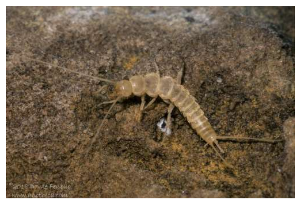
Figure 3. The Ozark Cave Silverfish ( Speleonycta ozarkensis ) observed in Duncan Field Cave, Adair Co., Oklahoma on 15 December 2017.