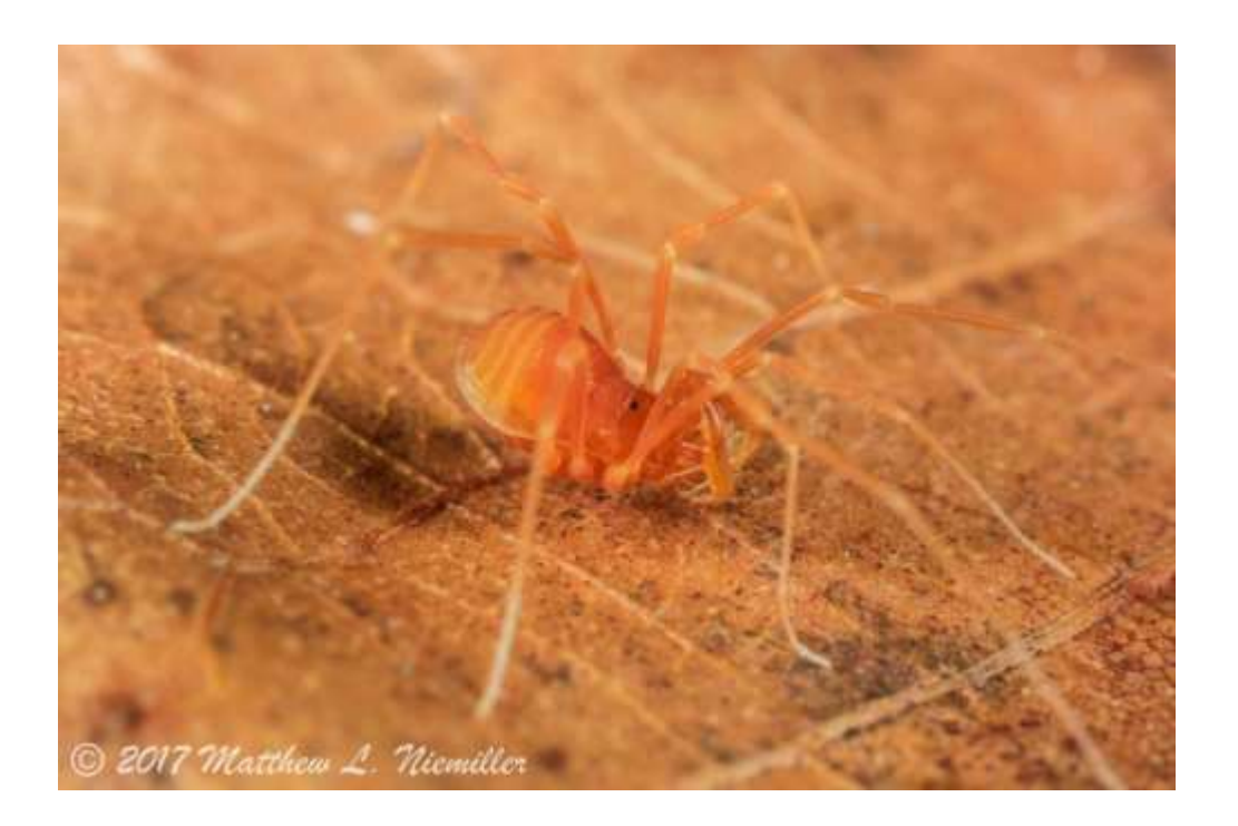
Figure 4. A Harvestman ( Crosbyella sp.) observed in Duncan Field Cave, Adair Co., Oklahoma on 15 December 2017.