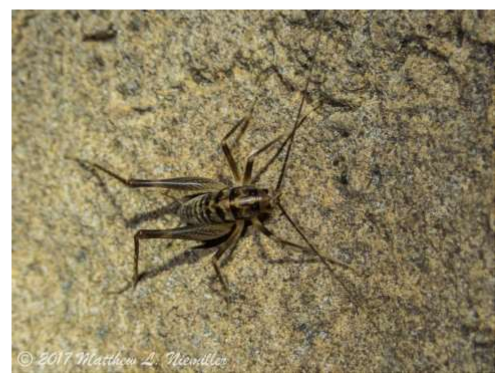
Figure 7. A Cave Cricket ( Ceuthophilus sp.) observed in Duncan Field Cave, Adair Co., Oklahoma on 15 December 2017.