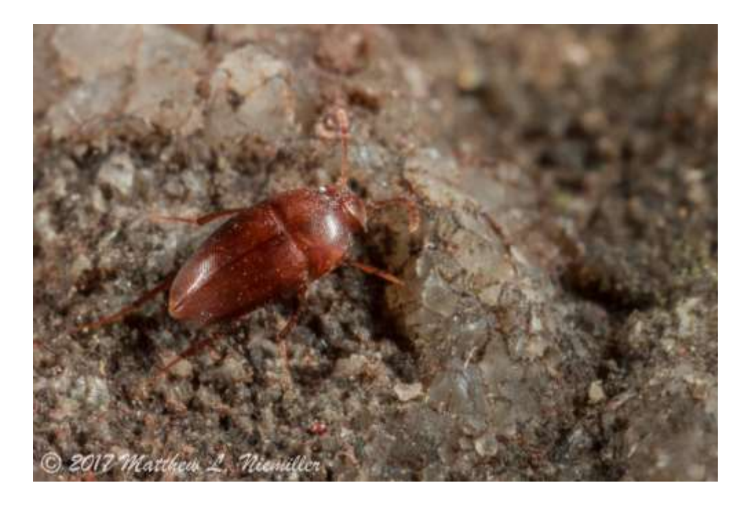
Figure 2. A Round Fungus Beetle ( Ptomaphagus shapardi ) observed in Duncan Field Cave, Adair Co., Oklahoma on 15 December 2017.