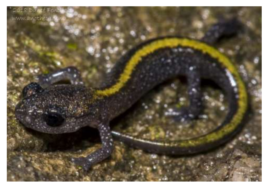
Figure 10. An Ozark Zigzag Salamander ( Plethodon angusticlavius ) observed in Duncan Field Cave, Adair Co., Oklahoma, on 15 December 2017.