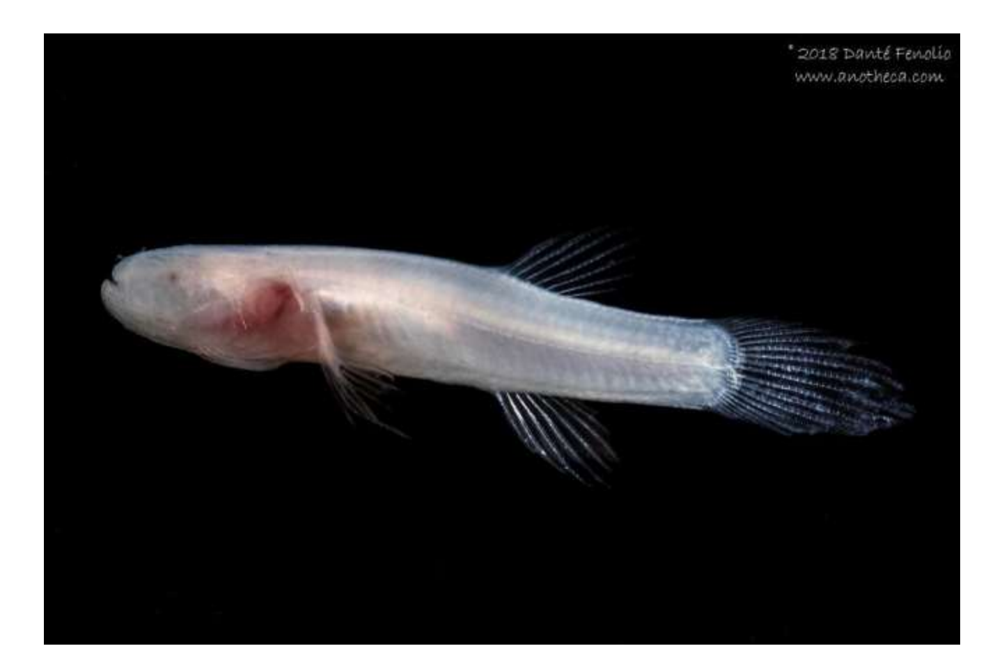
Figure 12. An Ozark Cavefish ( Troglichthys rosae ) observed in Long's Cave, Delaware Co., Oklahoma, on 16 December 2017.

permitted additional exploration. Dr. Niemiller proceeded ahead from this point exploring another ca. 200 m of passage. The first 100 m of this passage can be characterized as a series of crawls in water between small rooms where one can briefly stoop or stand. Three Oklahoma Cave Crayfish and one Ozark Cavefish were observed in this section. The passage then lowers and transitions into a narrow, joint-controlled phreatic tube (ca. 0.8 m in diameter) for another 100 m shifting into a bedding plane crawl (ca. 0.5 m) high filled with gravel and cobble. Dr. Niemiller stopped at this point and turned back to rejoin Carter and Jackson. However, a smaller person may be able to explore further. The group explored side passages formed along joints on the way back toward the entrance. In the most well- developed passage, which ranged 0.2–0.7 m in depth with mud/silt substrate, Niemiller and Carter observed four Ozark Cavefish, including a large adult estimated at 50–60 mm standard length.