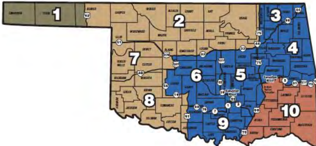
Figure 4: Antlerless Deer Management Zones